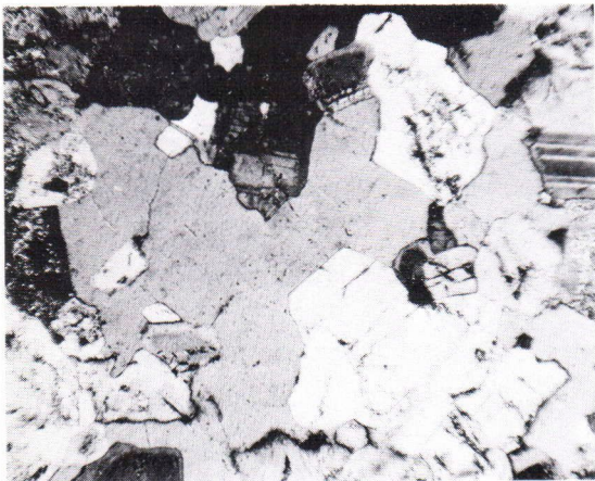
Fig. 2. Photomicrograph of the core. The interstice between the plagioclase crystal is filled with quartz.

Although, megascopically, the mantle can easily be divided into two shells, microscopically, the differences in the shells are not so obvious. The dark parts of the inner shell are richer in green biotite than the outer shell. The light parts of the inner shell