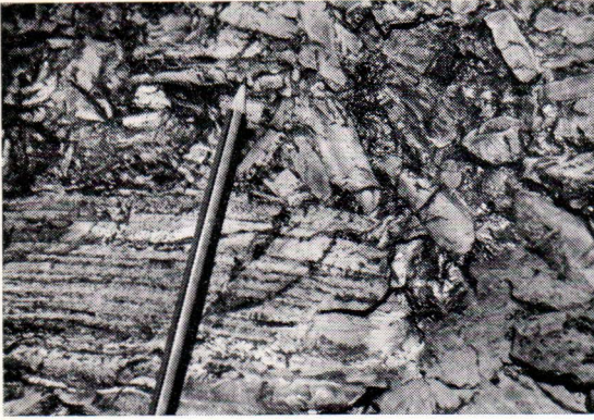
Fig. 2. Breccia at the top of macroband S_3 , Dales Gorge Member, west bank Beasley River Section.

only recorded from the eastern part in the Carawine Dolomite, (equated to the Witenoom Dolomite, de la Hunty, 1964). A 21 m. thick feldspathic sandstone is recorded in the Mt. Sylvia Formation at Newman (Anonymous, 1975) (compare to Fig. 1), but otherwise, nowhere westwards have shore line facies been recorded in the Hamersley Group which, with the exception of the Wyloo Anticline region (125 km west of the Turner Syncline, discussed by Horwitz, 1978) and the eastern margin of exposures (see Trendall & Blockley, 1970, Fig. 2) is relatively even in thickness and persistent throughout. Isopachs are published for the Dales Gorge Member only (Trendall & Blockley, 1970 pl. 3). Excluding the southwest corner, their data indicate a relatively simple pattern, exemplified by a section starting at Paraburdoo, in the south (135 m. approx. thickness), to 100 km northeast, near Mt. Bruce (about 165 m. thick), to the type section (142 m. in thickness) some 40 km further northeast. Bourn & Jackson (1979, p. 190), and more recently Ewers & Morris (in press) indicated that near Paraburdoo, BIF (banded cherty iron formation) macroband thicknesses are comparable with those of the type section and the thinning is reflected in the intervening S (shale, chert and siderite) bands. The steeper gradients of the southwest in the Dales Gorge Member isopach map are largely due to measure-